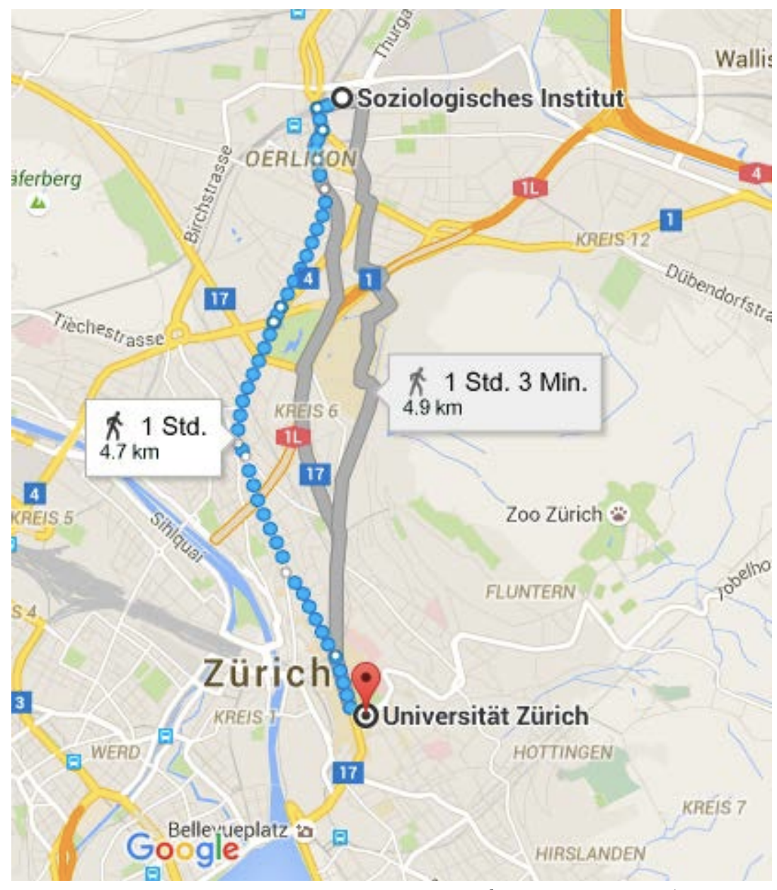
Map: From Andreasstrasse 15 to Rämistrasse 71

{}^{\mathbb{Q}}_{\mathbb{Q}} You can take a walk and explore Zurich (see overwiew map).