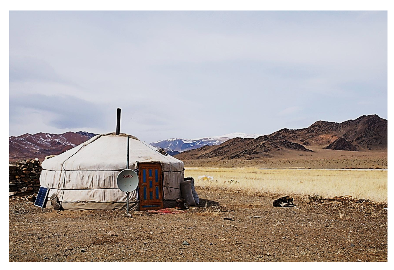
Jointly organized by

Central Asia in the XXI Century. Historical Trajectories, Contemporary Challenges and Everyday Encounters October 8-11, 2015. Zurich, Switzerland